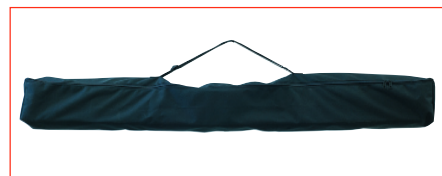
Fitting carrying bags available for all tripod projection screens.